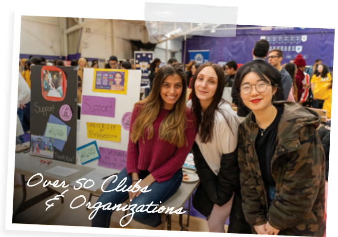
Over 50 Clubs & Organizations

Find yourself at UB! University of Bridgeport offers many opportunities to engage, connect, and immerse yourself in life on campus with your fellow students. Forming connections between your education and campus life will encourage you to acquire new information and skills, form new attitudes and insights, and better understand yourself and the world around you.